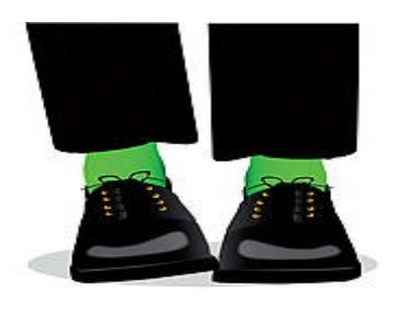
5. He _____ shoes.