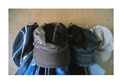
3. They ____ caps.