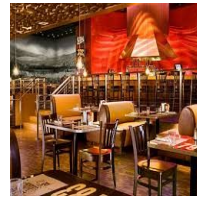
hole in the wall