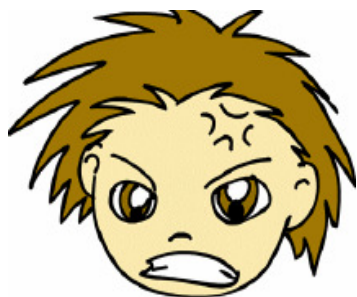
angry 憤怒 / 生氣